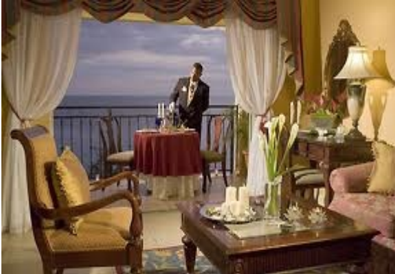
Food safety and F&B services