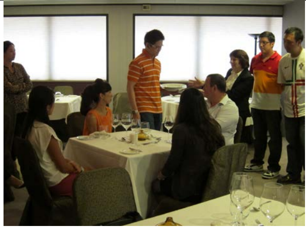
Table set up, receiving guests & sitting protocol