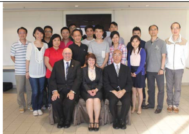
Group photo for the 2nd class