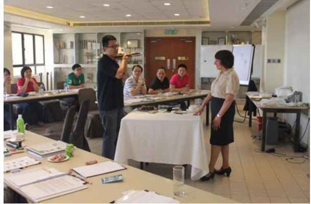
Valet and in-room dining