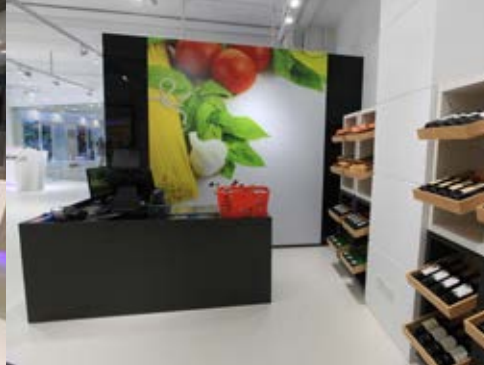
BOCHK Financial Services Learning Centre 中銀香港金融服務學習中心