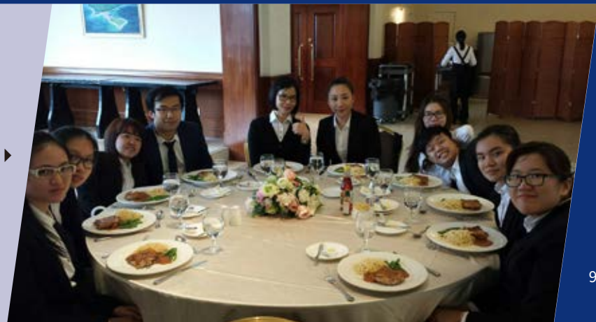
Learning Table Etiquette 餐桌禮儀活動 ▶