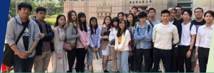
◀ Visit to the West Kowloon Law Court 參觀西九龍法院