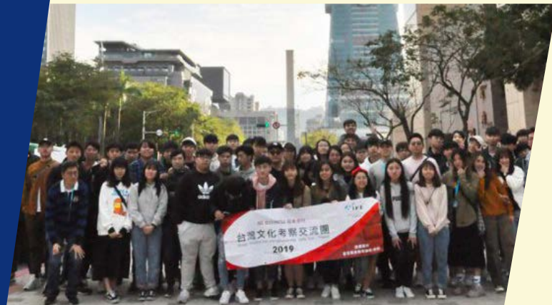
◀ Study Tour to Taiwan 台灣交流團