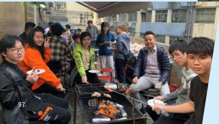
◀ BBQ Fun Day 燒烤樂