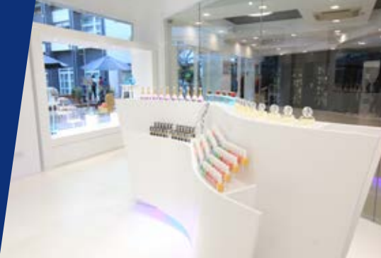
Retail Lab 零售體驗廊