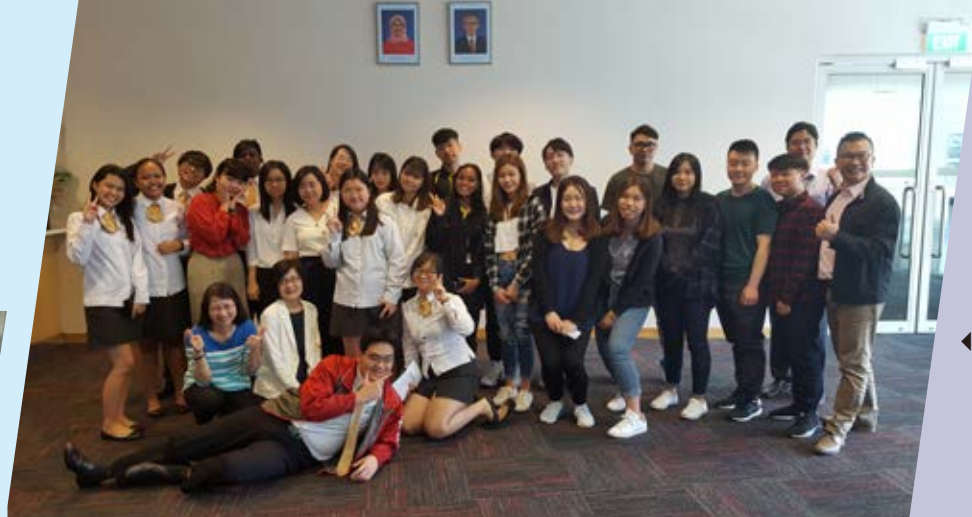
◀ Meeting with ITE Exchange Students 與新加坡交流團會面