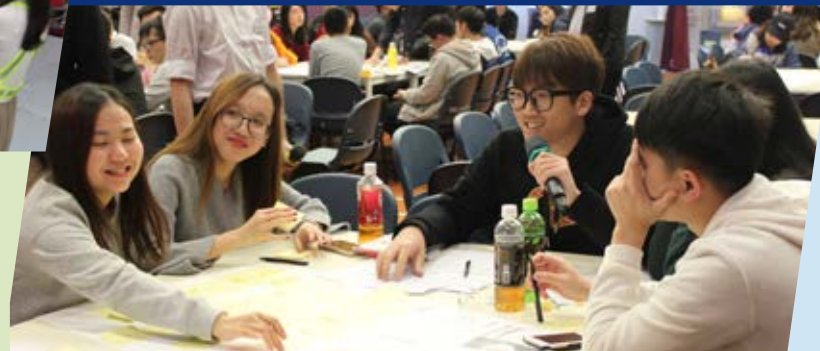
◀ Design Thinking Workshop 設計思考體驗課