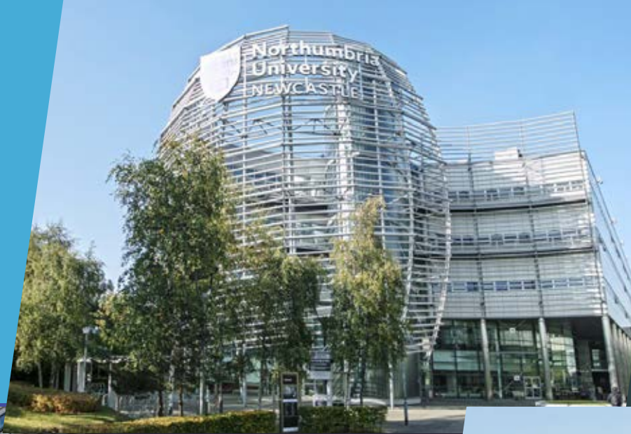
University of Northumbria at Newcastle, UK 英國紐卡素洛森比亞大學 (UNN)