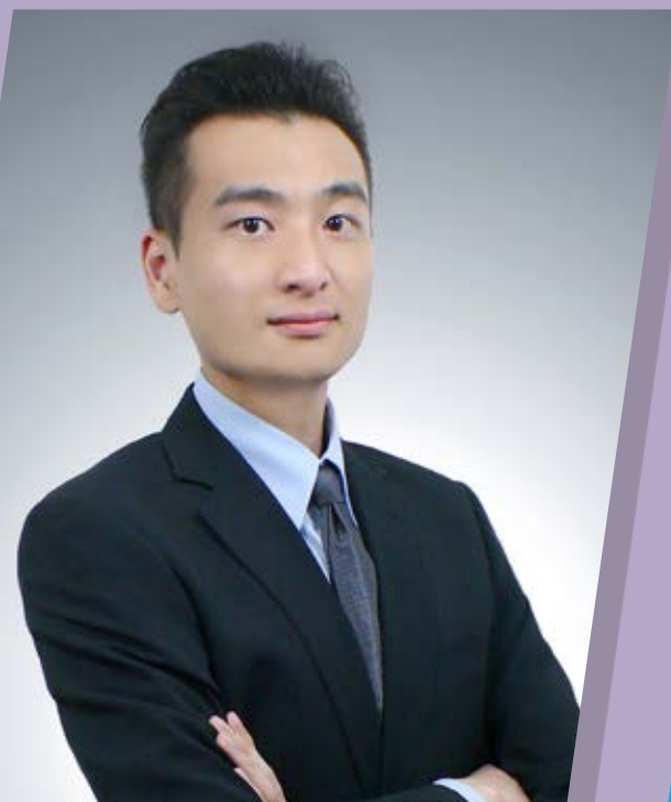
Assistant Manager Cushman & Wakefield Property Management Limited 戴德梁行物業管理有限公司 助理經理

HD in Real Estate Management (now renamed as HD in Real Estate & Property Management)