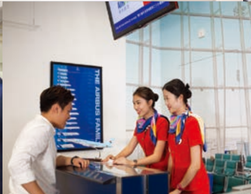
Air TY Centre 青衣航空中心