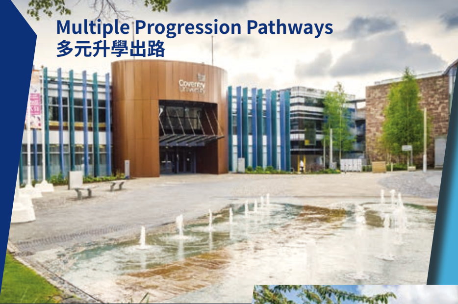
Coventry University, UK 英國考文垂大學 (CU)