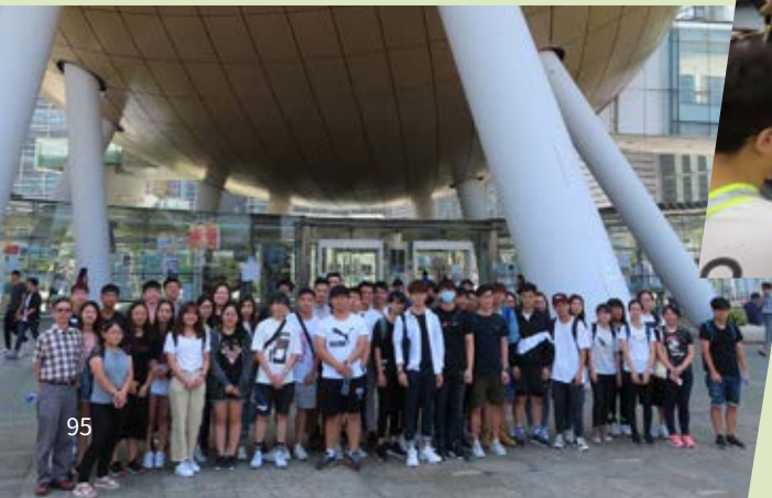
◀ Visit to Hong Kong Science Park 參觀香港科學園