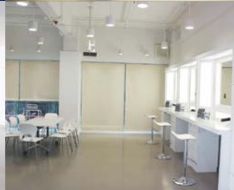
K Concept Studio 奇·概念館