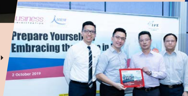
Lecture "Prepare Yourself for Embracing the Future in HR" delivered by Guest from Hong Kong Institute of Human Resources Management 「香港人力資源管理學會」行業專家課堂 ▶