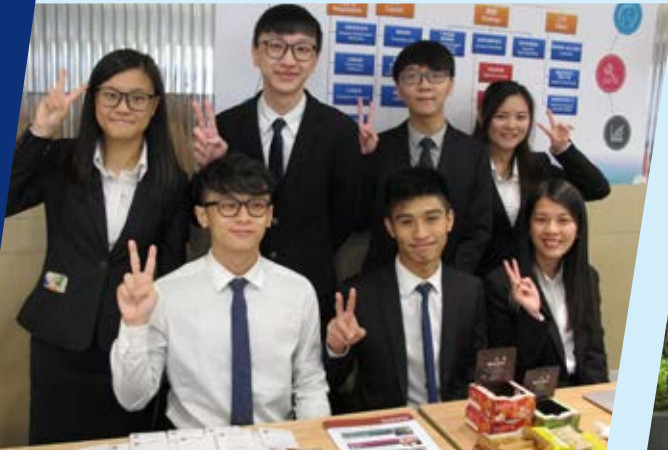
◀ IVE Info Day IVE 資訊日