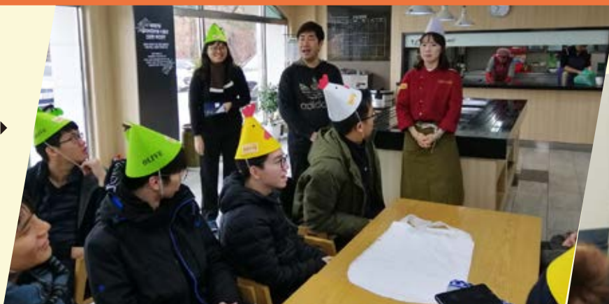
Study Tour to Korea 韓國交流團 ▶