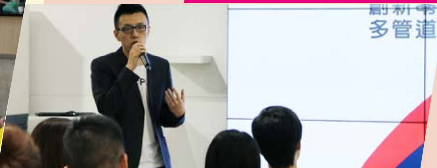
Omni Channel Retailing Seminar by Guest Speaker from Omni Channel 零售行業專家課堂 ▶