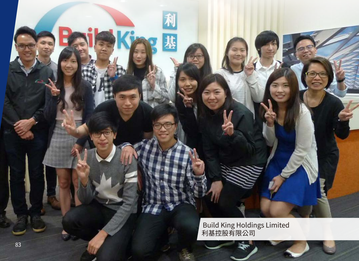
Build King Holdings Limited 利基控股有限公司