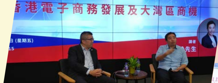
Connecting Opportunities in the Greater Bay Area - Hong Kong ◀ E-commerce Development 粵港澳大灣區講座系列 - 香港電子 商務發展及大灣區商機