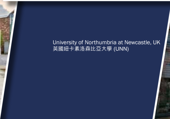
University of Northumbria at Newcastle, UK 英國紐卡素洛森比亞大學 (UNN)