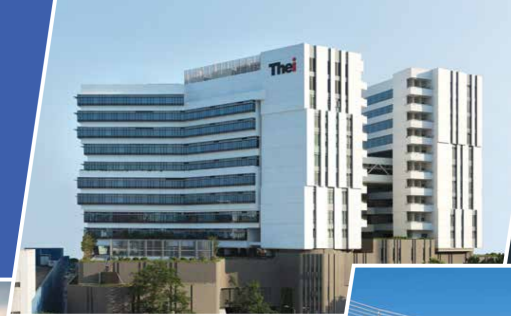
Technological and Higher Education Institute of Hong Kong 香港高等教育科技學院 (THEI)