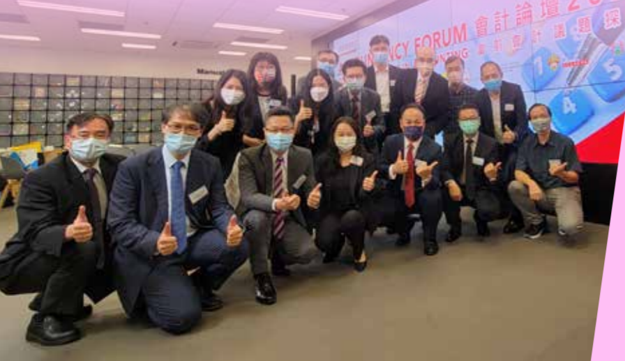
◀ 20th Accountancy Forum