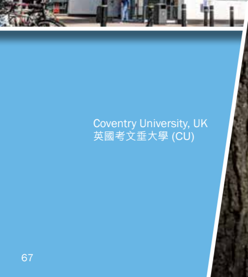
Coventry University, UK 英國考文垂大學 (CU)