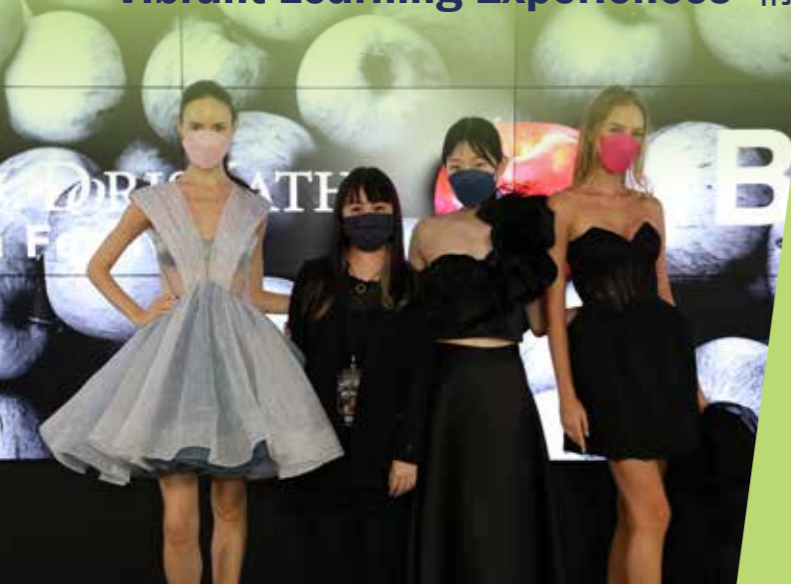
◀ IVE Business x DorisKath Fashion Festival – Be Yourself