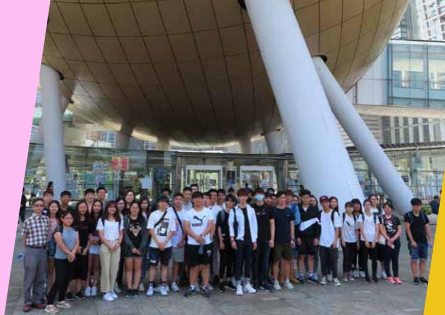
◀ Visit to Hong Kong Science Park