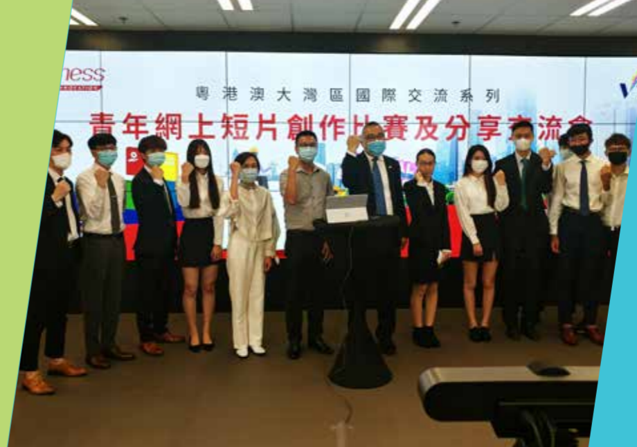
◀ Virtual Exchange with Guangzhou Huashang College