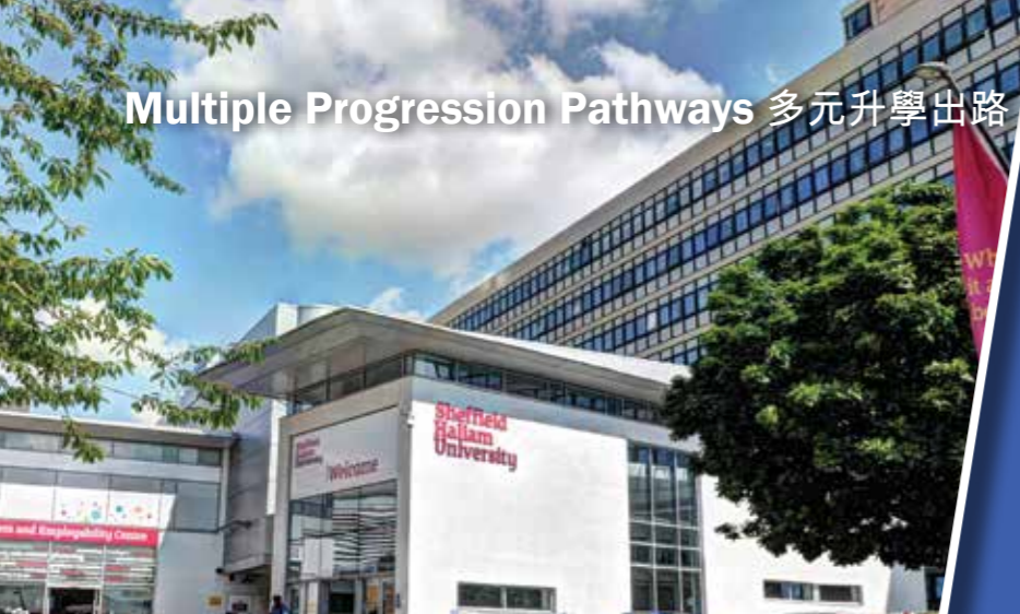
Sheffield Hallam University, UK 英國謝菲爾德哈蘭大學 (SHU)