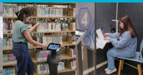
LEARNING RESOURCES CENTRE 學習資源中心