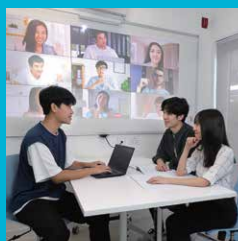
LEARNING COMMONS 學習共享空間