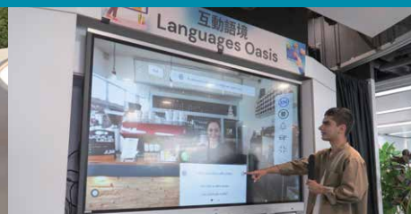
CENTRE FOR INDEPENDENT LANGUAGE LEARNING 語文自學中心