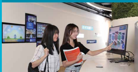
SMART CORRIDOR 智慧走廊