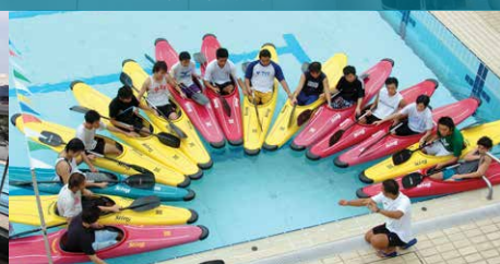
50-METRE SWIMMING POOL 50米泳池