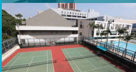
WELLNESS CENTRE 健樂中心