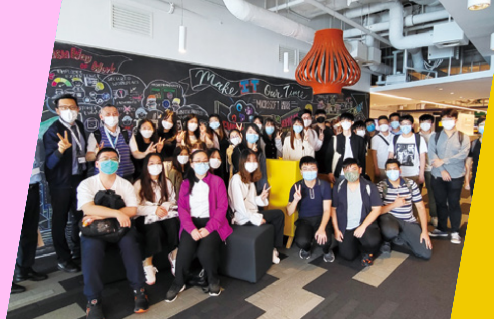
Visit to Microsoft Experience Centre 參觀Microsoft體驗中心