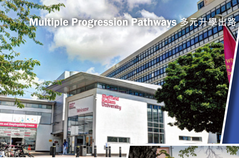
Sheffield Hallam University, UK 英國謝菲爾德哈蘭大學 (SHU)