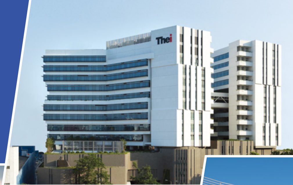
Technological and Higher Education Institute of Hong Kong 香港高等教育科技學院 (THEi)