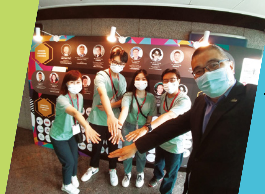
◀ BUSINESS GOVirtual Expo & Conference 虛擬經濟博覽及會議