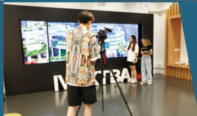
◀ Studio ONE