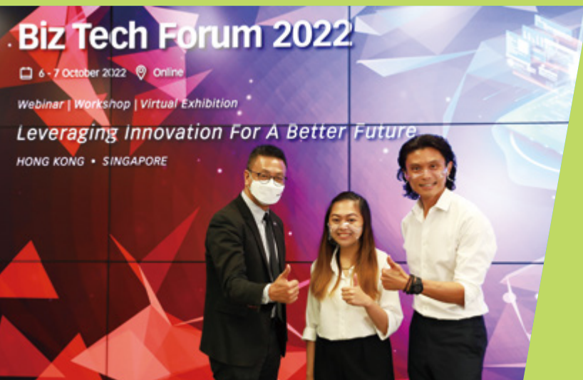
◀ Biz Tech Forum 2022 商業科技論壇 2022