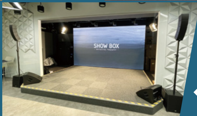
◀ SHOW BOX 展演空間