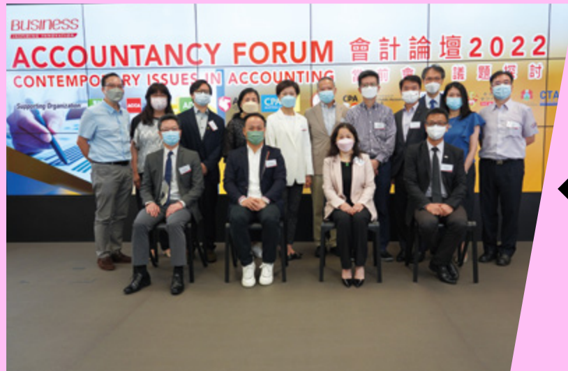
Accountancy Forum 2022 會計論壇 2022