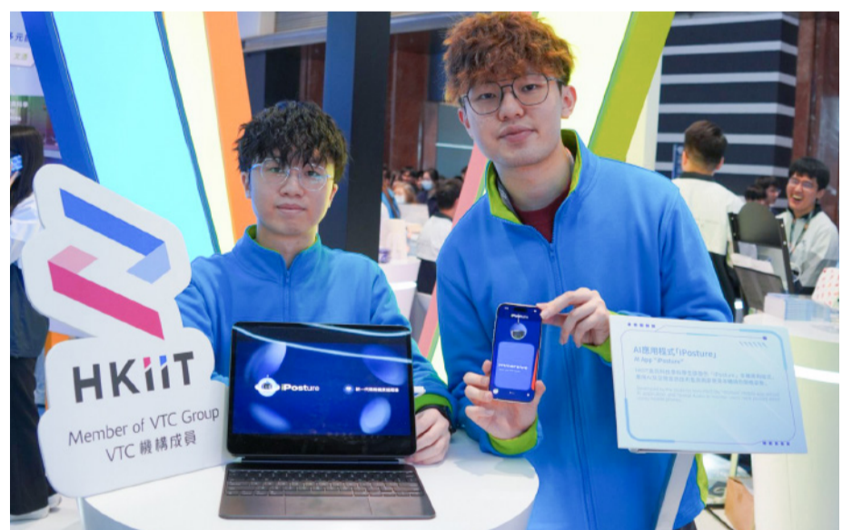
A range of innovative projects developed by student-teacher teams are showcased, demonstrating the VPET learning outcomes.