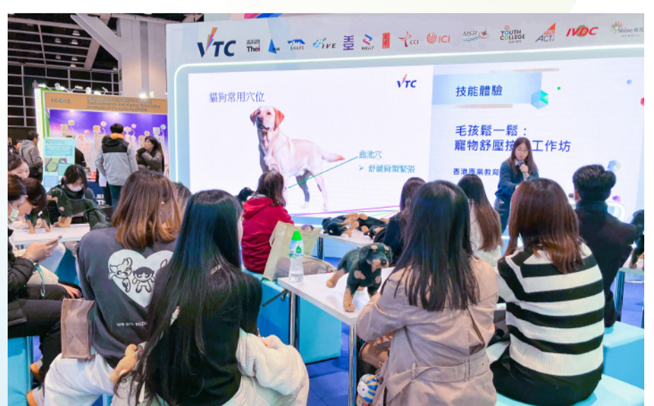
The VTC booth also offers a range of skills demonstrations and hands on activities, giving participants a first hand experience of practical techniques across different professional fields.