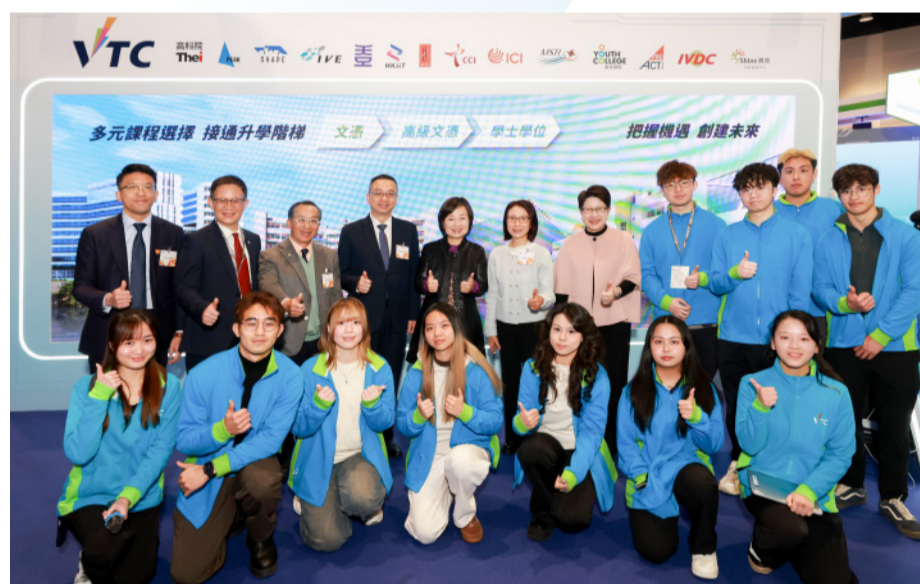
Secretary for Education Dr CHOI Yuk lin (fifth from the left in the back row) visits the VTC booth and speaks with VTC students to learn about how they put their knowledge into practice.

These innovative projects reflect the outcomes of VPET, embodying VTC’s emphasis on integrating “think and do” approach and enabling students to apply their professional knowledge to address real world and community needs.