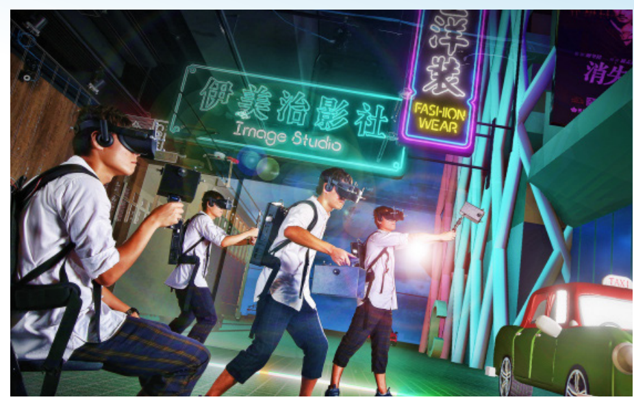
媒體研究所 Medtia Lab

這項計劃由HKDI不同學系學生以跨學科模式合作進行。學生把設計工藝理念應用於環保回收物料當中,將昔日的飯堂改建成別幟一格的學習及優閒空間。過程既可以讓學生發揮創意,將所學的知識應用於生活當中,同時也為校園帶來煥然一新的感覺。