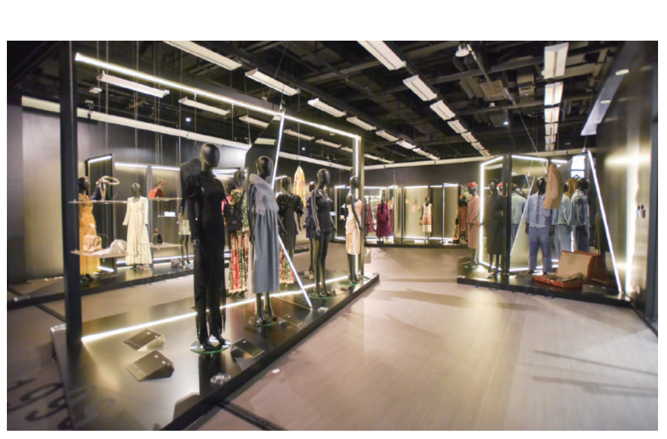
時裝資料館 Fashion Archive

Furthermore, the HKDI campus is designed to provide an open and dynamic learning environment for students. Its distinctive features were awarded in an architectural design competition. HKDI comprehensive campus facilities such as Media Lab, Fashion Archive, HKDI DESIS Lab, Centre of Design Services and Solutions, Centre of Innovation Material and Technology, and Centre for Communication Design to cater to students' learning needs across disciplines. By building a strong network with mainland and overseas design institutions, HKDI students can develop a global mindset and connect to the world through international exchange and project collaboration.