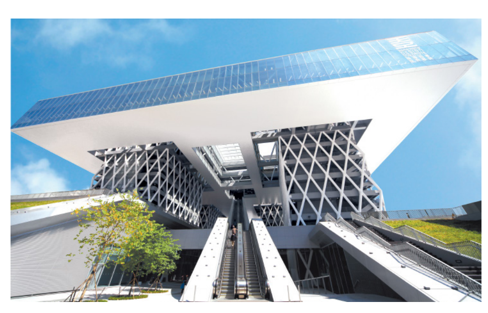
香港知專設計學院 Hong Kong Design Institute

Located at Tiu Keng Leng, HKDI has been dedicated to internationally acclaimed providing programmes to nurture design talent for Hong Kong's creative industries. HKDI has been offering over 20 design programmes including Architecture, Interior and Product Design, Communication Design, Digital Media, and Fashion and Image Design. After completing two years of Higher Diploma programmes at HKDI, students can articulate to bachelor's degree programmes in related disciplines offered by renowned overseas universities. Over the years, HKDI has nurtured numerous outstanding creative talents. Both students and graduates achieved remarkable success in various international and local design competitions.