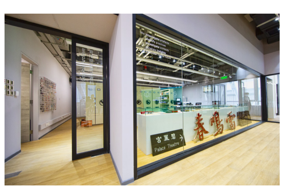
傳意設計研究中心 Centre for Communication Design

此外,HKDI校舍亦饒富特色,為學生提供互動開放的學習環境,啟發創意思維,曾獲建築殊榮。校內教學設施完備,設有媒體研究所、時裝資料館、社會設計工作室、知專設創源、設計企劃研究中心、傳意設計研究中心等,可滿足學生不同的學習需要。學院還與國內外的設計學院和業界緊密合作,為學生提供參與國際交流計劃及實踐經驗的機會,以擴闊學生視野。