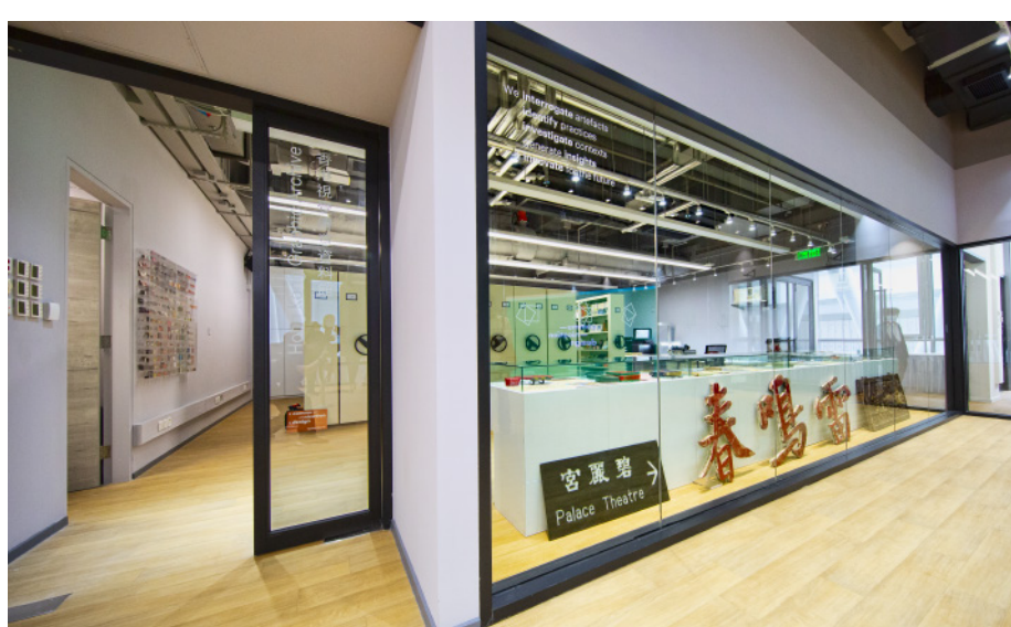
传意设计研究中心 Centre for Communication Design

Furthermore, the HKDI campus is designed to provide an open and dynamic learning environment for students. Its distinctive features were awarded in an architectural design competition. HKDI offers comprehensive campus facilities such as Media Lab, Fashion Archive, HKDI DESIS Lab, Centre of Design Services and Solutions, Centre of Innovation Material and Technology, and Centre for Communication Design to cater to students' learning needs across disciplines. By building a strong network with mainland and overseas design institutions, HKDI students can develop a global mindset and connect to the world through international exchange and project collaboration.