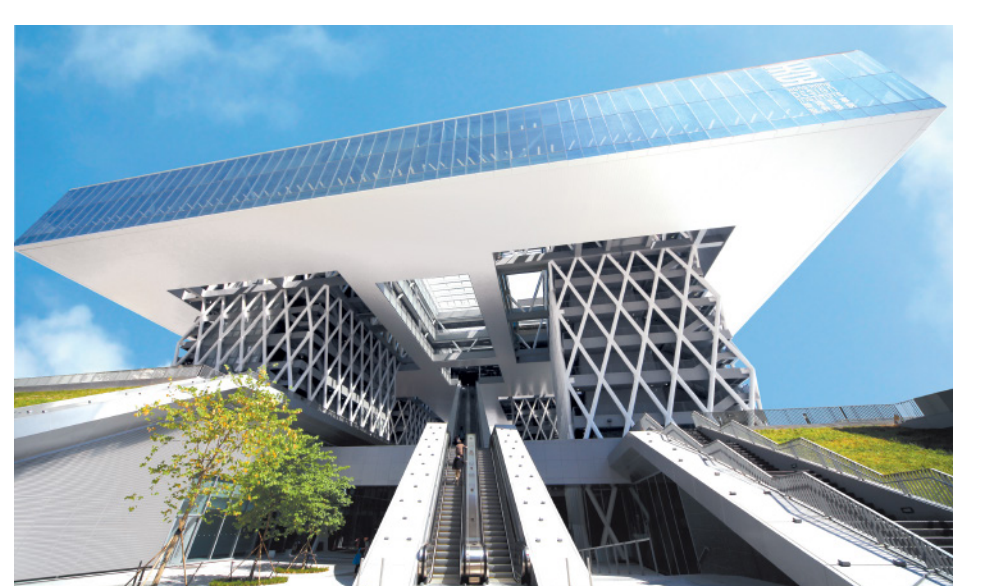
香港知专设计学院 Hong Kong Design Institute

Located at Tiu Keng Leng, HKDI has been dedicated to providing internationally acclaimed design programmes to nurture design talent for Hong Kong's creative industries. HKDI has been offering over 20 design programmes including Architecture, Interior and Product Design, Communication Design, Digital Media, and Fashion and Image Design. After completing two years of Higher Diploma programmes at HKDI, students can articulate to bachelor's degree programmes in related disciplines offered by renowned overseas universities. Over the years, HKDI has nurtured numerous outstanding creative talents. Both students and graduates achieved remarkable success in various international and local design competitions.