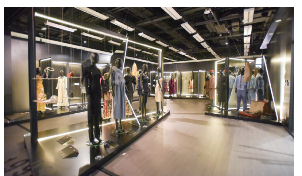
时装资料馆 Fashion Archive