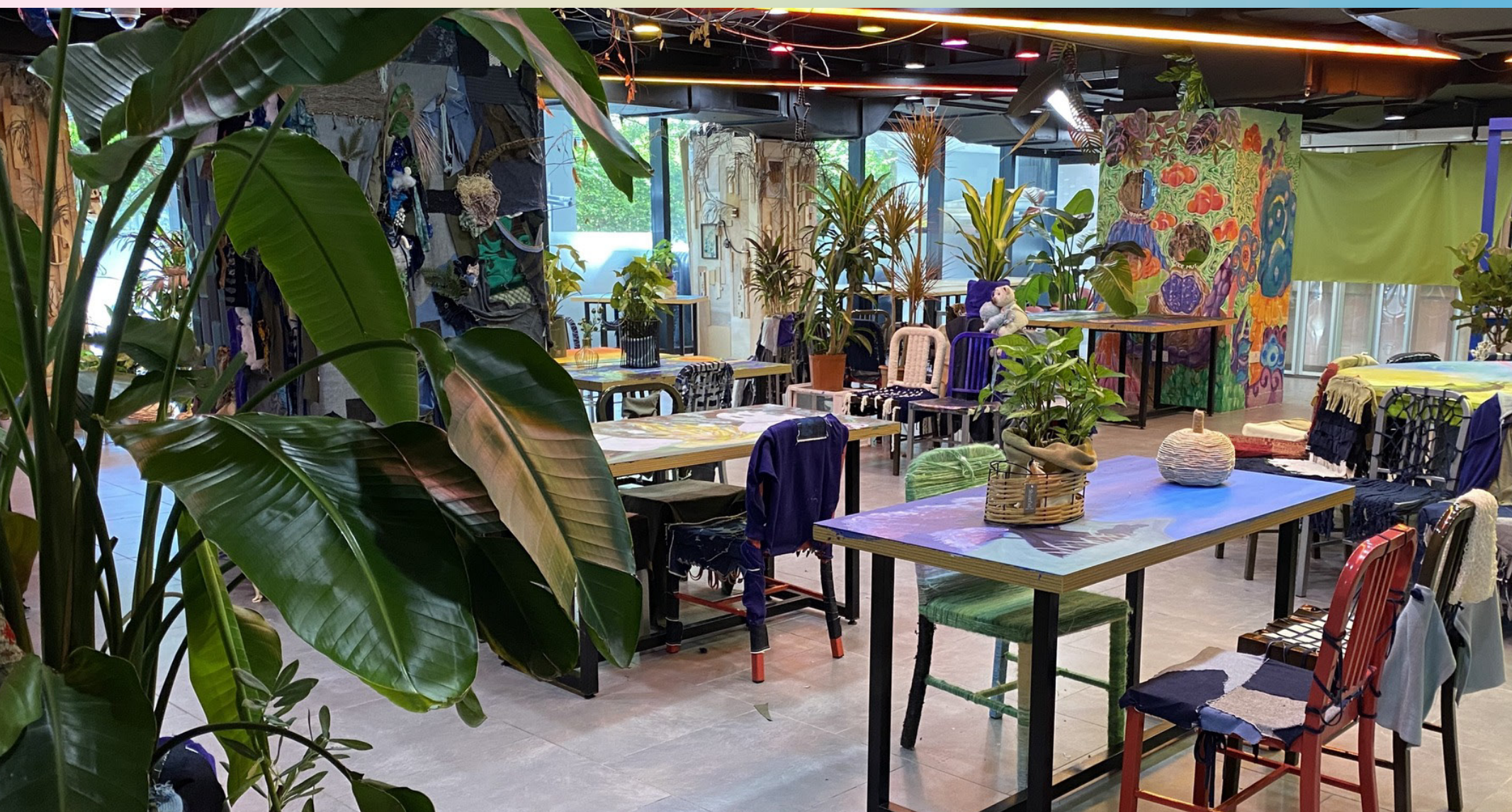
共享空间 Co-work Space

VTC机构成员香港知专设计学院(HKDI)60位学生于早前在驻校创作者及导师带领下,运用缤纷色彩与素材,为校园打造全新共享空间。