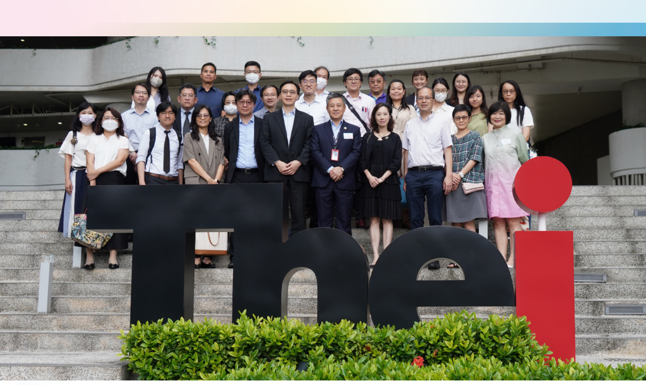
屯門區中學校長會代表團參觀THEi高科院柴灣校舍。 A delegation from Tuen Mun District Secondary School Heads Association visits THEi (Chai Wan).

屯門區中學校長會代表團一行28人於6月23日到訪 多間VTC機構成員,了解VTC提供的多元課程,以及 職業專才教育的升學路徑。