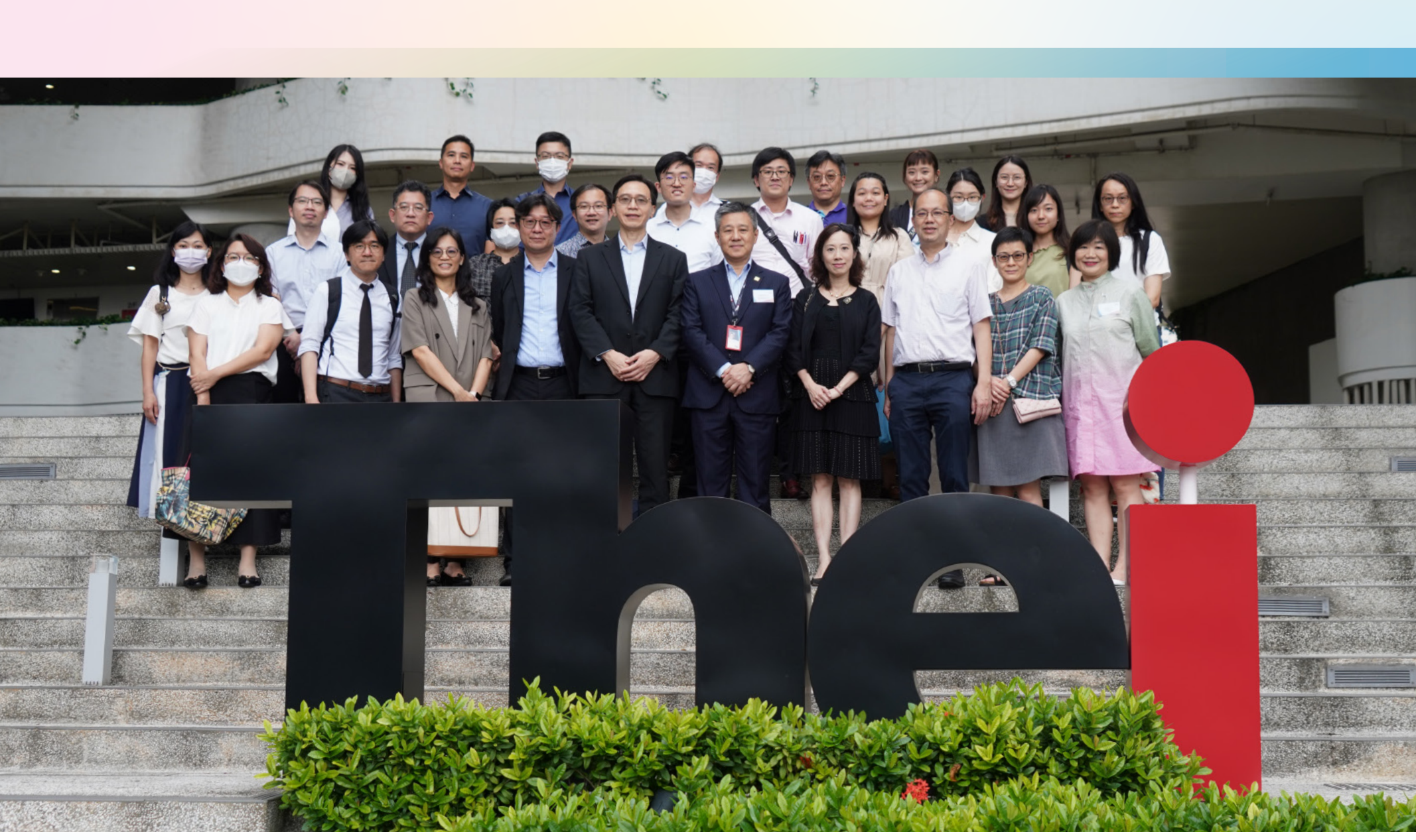
屯门区中学校长会代表团参观THEi高科院柴湾校舍。 A delegation from Tuen Mun District Secondary School Heads Association visits THEi (Chai Wan).

屯门区中学校长会代表团一行28人于6月23日到访 多间VTC机构成员,了解VTC提供的多元课程,以及 职业专才教育的升学路径。