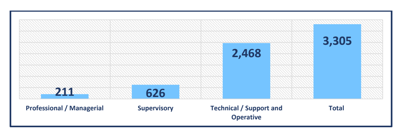
Number of vacancies in the 2015 manpower survey of the RESI (by level)

With the global economy continues to improve, it is anticipated that there will be an overall increase in the future manpower demand across the four sectors of the industry. This can be reflected in the large number real estate services related recruitment advertisements captured by the desk research during the research period.