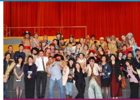
The full cast enjoyed their performance very much