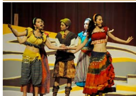
Dorothy plays the protagonist Moses (middle) & the enchanting gypsy girls