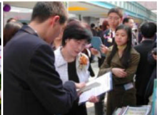
Students from TWGHs Kwok Yat Wai College introduce their operation of VE in secondary school.