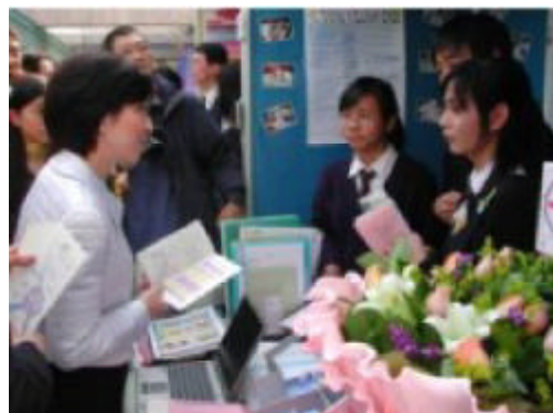
BSM students introduce their booths and displays to Mrs. Fanny Law